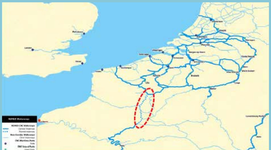
Location of Canal Seine-Nord Europe.

The map shows how all the seaports in the range between Dunkerque and Amsterdam are connected to a dense network of rivers, canals, and associated inland ports and industrial areas. The Seine-Scheldt project aims to extend this network by completing the link between Paris and Belgium, thus also giving access to the Oise and Seine Rivers, as far as the port of Le Havre, and the Atlantic Corridor.